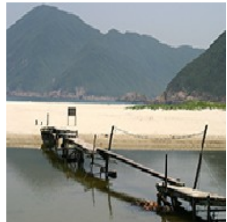
Sai Kung East Country Park