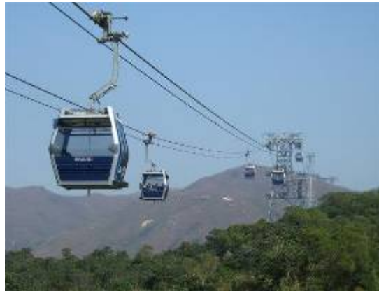
Ngong Ping 360 Cable Car Ride