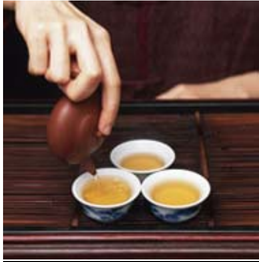
Chinese Tea Culture