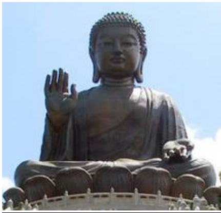
The Giant Buddha Statue

The largest outlying island in Hong Kong, known for its unspoilt countryside, virgin hills and lush green valleys.