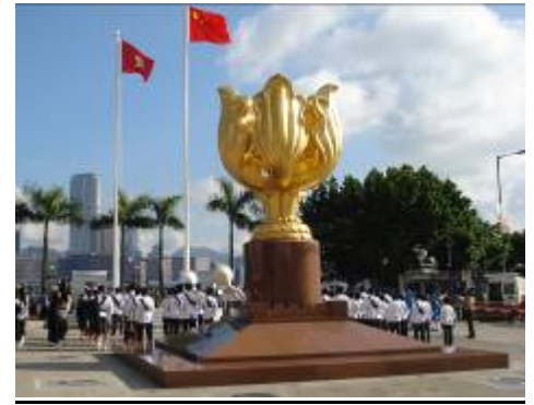
Golden Bauhinia Square