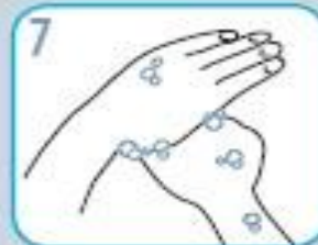
7 Rub each thumb clasped in opposite hand.