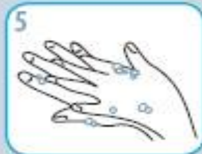
5 Rub back of each hand with palm of other hand.