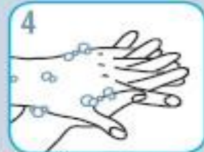
4 Rub in between and around fingers.