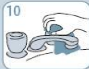
10 Turn off water using paper towel.