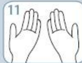
11 Your hands are now safe.