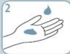
2 Apply soap.