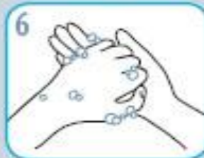
6 Rub fingertips of each hand in opposite palm.