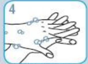
4 Rub in between and around fingers.