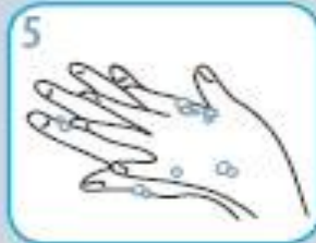
5 Rub back of each hand with palm of other hand.