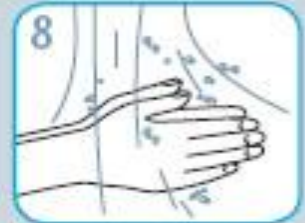
8 Rinse thoroughly under running water.