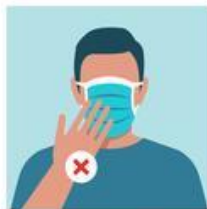
DO NOT TOUCH THE MASK WHILE USING IT, IF YOU DO WASH YOUR HANDS