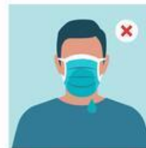
REPLACE THE MASK IF IT GETS DAMP AND DO NOT REUSE IT