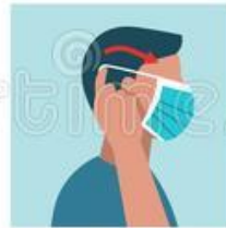
REMOVE THE MASK FROM BEHIND BY HOLDING THE STRINGS WITH CLEAN HANDS