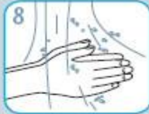
8 Rinse thoroughly under running water.