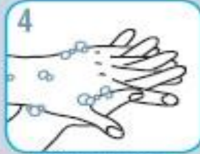
4 Rub in between and around fingers.