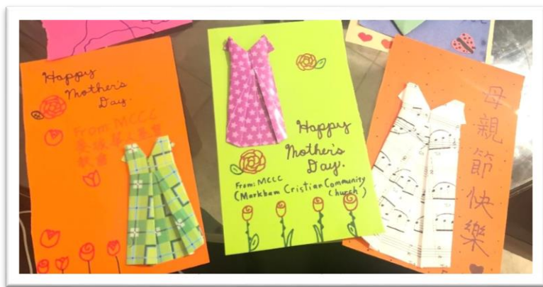
Handcraft Mother's Day cards that will be given out. 手工製作的母親節卡片將會被分發

因著疫情，家人們未能與至愛出外共膳。我們明白到住客的心情，故此，我們加倍計劃，務求讓住客感受到家的溫暖。頤康的膳食部經理認真收集住客寶貴意見，根據住客的喜好精心設計了特別的母親節菜單。