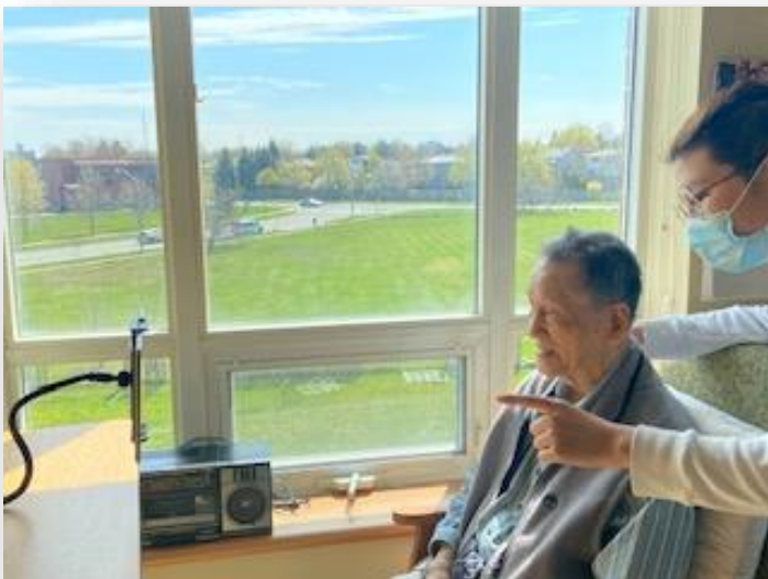
Resident enjoys video chat with family members. 住客很享受與家人視頻聊天的時光。

Video Chats have made a positive impact on the residents, as it connects everyone on the same page. Not only did it open up more meaningful conversations, but it also give them a new way to connect to family members. On average, we have completed over 110 video calls per week!