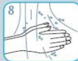
8 Rinse thoroughly under running water.