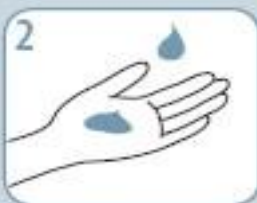
2 Apply soap.