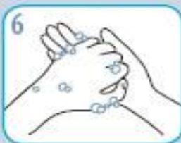
6 Rub fingertips of each hand in opposite palm.