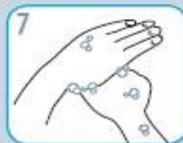
7 Rub each thumb clasped in opposite hand.