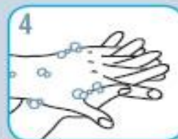
4 Rub in between and around fingers.