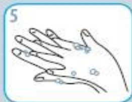
5 Rub back of each hand with palm of other hand.