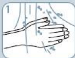
1 Wet hands with warm water.